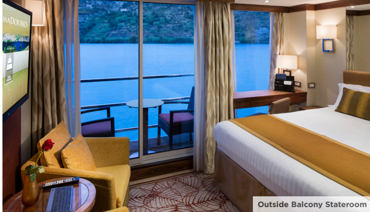
Outside Balcony Stateroom

7-night river cruise | August 17-24, 2024 | aboard AmaDouro