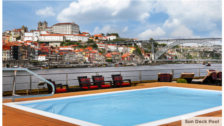
Sun Deck Pool