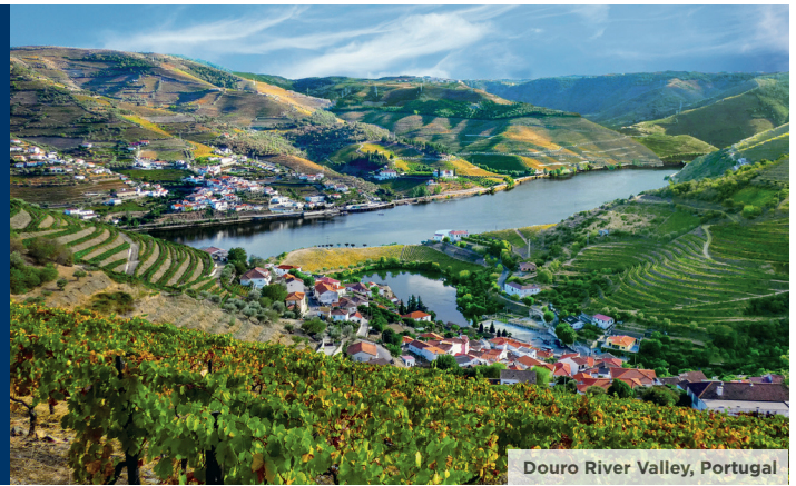
Douro River Valley, Portugal

7-night river cruise roundtrip from Porto August 17-24, 2024 | AmaDouro